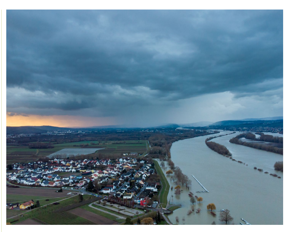
\textbf{Flooding across the Rhine basin in Germany smashed all records in July 2021.} \ \ \textbf{Source: iStock.}

In fact, a recent report published by First Street Foundation<sup>3</sup> shows that nearly a quarter of US critical infrastructure – utilities, airports, ports and more – are now at risk from flooding (Figure 1).